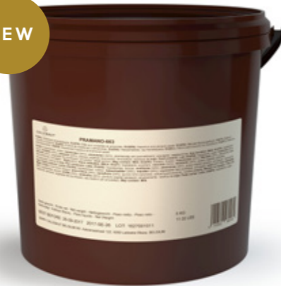
NUT PASTE 5 kg

CALLEBAUT® Pra-Class 5kg (with sugar) NEW