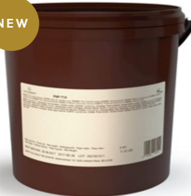
NUT PASTE 5 kg

CALLEBAUT® PNP 663 5kg (no added sugar) NEW